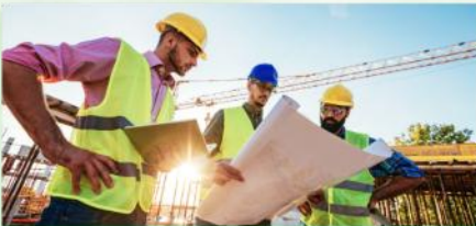
Be Work Ready